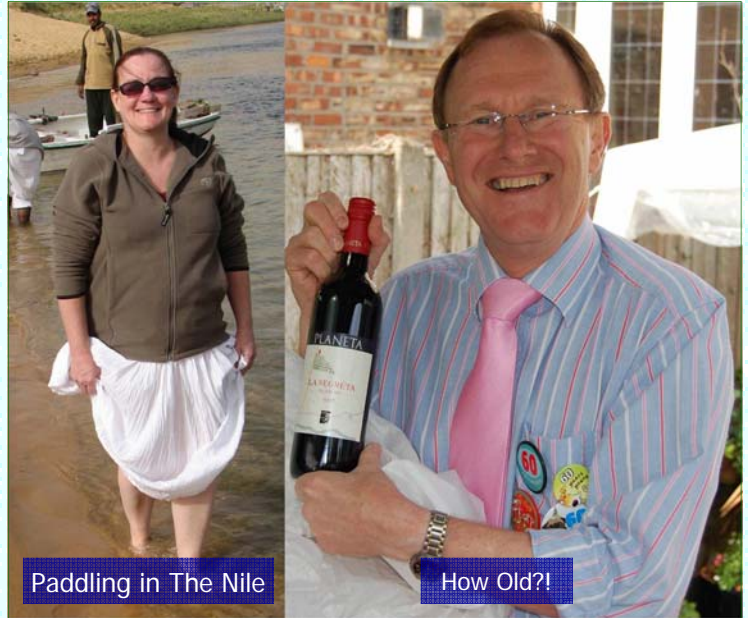
Paddling in The Nile

I suppose that with future grandparenthood comes the wisdom of age and, as you know, I began my seventh decade in June with my child bride only starting her sixth last January. But it's GREAT— bus pass, free prescriptions, free swimming, cheap theatre tickets, winter heating allowance and many more benefits. But