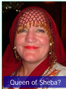
Queen of Sheba?