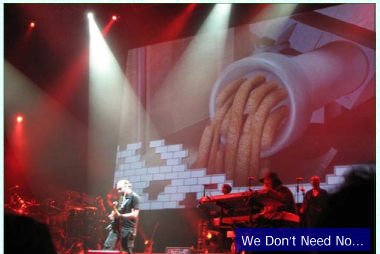
We Don't Need No...