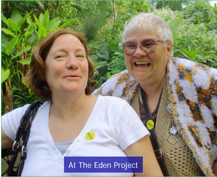
At The Eden Project