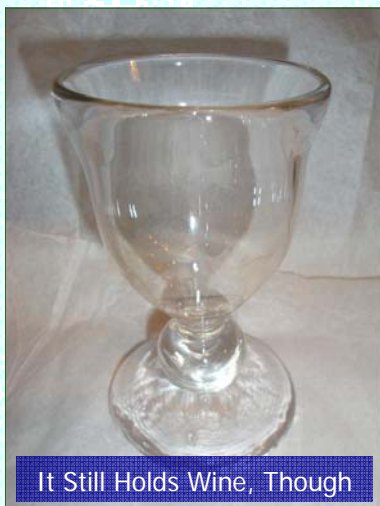
It Still Holds Wine, Though