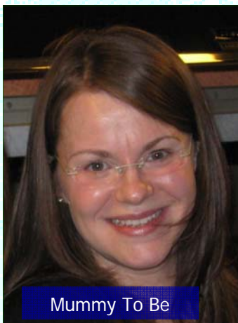
Mummy To Be